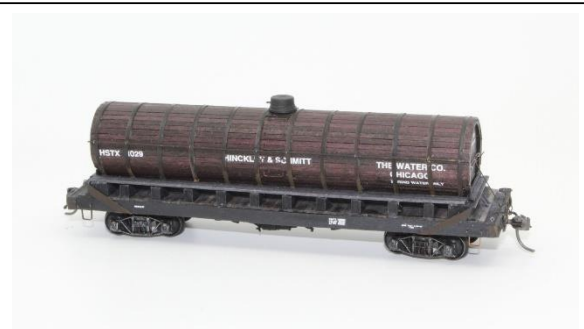
Freight Car Kevin O'Conner - Wood Tank Car