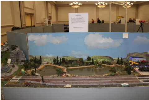
Favorite Module - HO Scale (Triple Tie) Steve Bienstock - Pandapas Pond