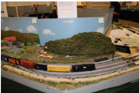
Favorite Module - HO Scale (Triple Tie) Steve Bienstock & Jim Flynne - New River Trail Park