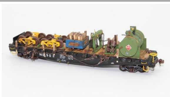
Non-Revenue Joe Walters - Boom Car NE 503