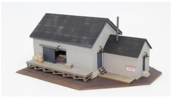
Structure Off-Line (Tie) John Pursell - Small Town Warehouse