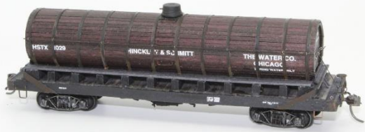
Best in Show Kevin O'Conner - Wood Tank Car