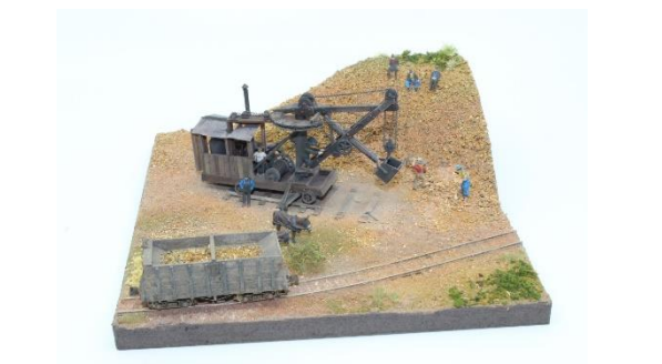
Display On-Line Jerry Lauchle - Ore Steam Excavator