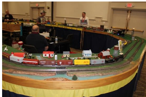
Favorite Module - S Scale (Tie) Marvin Thiel - The Swamp