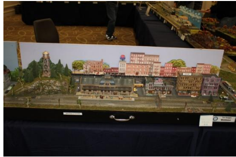
Favorite Module - N Scale Tom Spiggle - Middleton