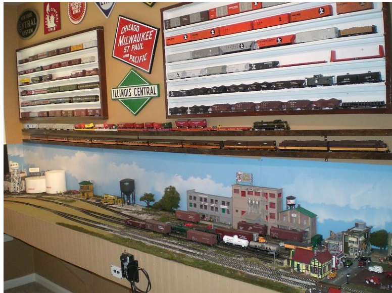
Overall picture of Timbuktu Leg of Layout

The Rockford Belt Line is the third iteration of the layout in the current location. The others got too complicated. Now it is simple. It is an "L" shaped layout one leg being 8' by 30" and the other leg being 10' by 24 ". The largest industry served is the Lab Gas Company makers of fine perfumes (you must be a current or past owner of a Labrador Dog to appreciate the humor). The RBL also services the Dry Well Ink Company, Guido's Arms supplier to Gangs and Insurgents, US Congress Pork Barrel Distribution Center operated by the Halliburton Company, Mooney Plumbing, Earl Oil, a Team Track, a junk yard (not named), and a Rockford freight house. There is a Car and Engine Repair facility, and engine servicing (Steam and Diesel). Rockford has tall buildings, a park and cemetery. Timbuktu has all of the normal village buildings. There is a commuter service between Rockford and Timbuktu.