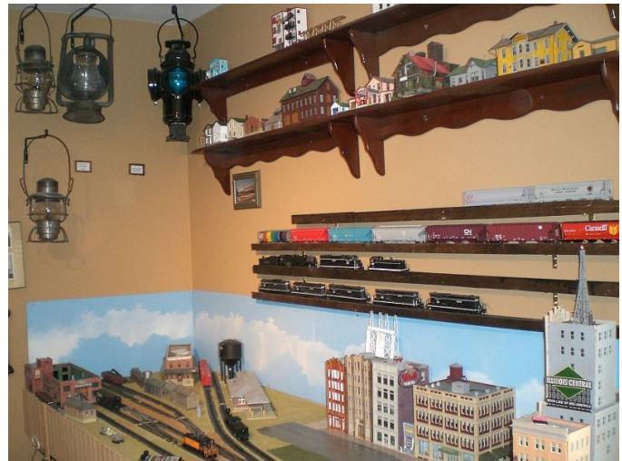
Rockford Side of Layout

The plan is to have operating sessions that will consist of a Rockford Switcher, a Timbuktu switcher and the commuter train operator. Each switcher operator would receive a switch list for the distribution of interchange freight cars, the changing of position and distribution of freight cars at industries, and the assembling of an outbound interchange. The commuter operator would be responsible for on time departures and arrivals between Rockford and Timbuktu.