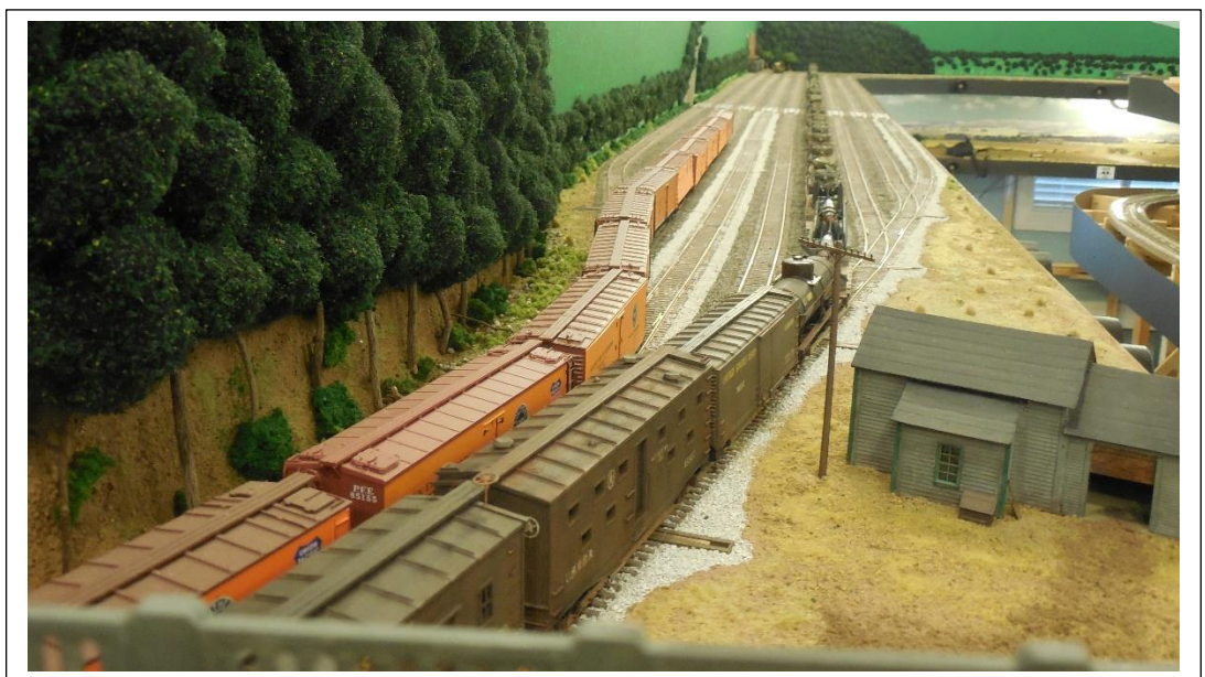
Pic 7: Viewed from the overpass, the finished train is 16 feet long (almost 1400 scale feet). Helper service will be mandatory for this consist.