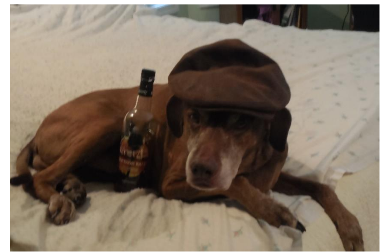
Pic 8: It looks like Elway is already in the spirit of our upcoming trip on the Bourbon Trail in Kentucky.