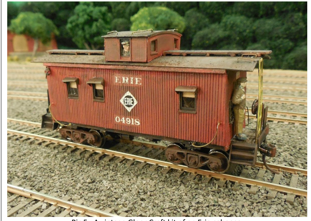
Pic 5: A vintage Gloor Craft kit of an Erie caboose.