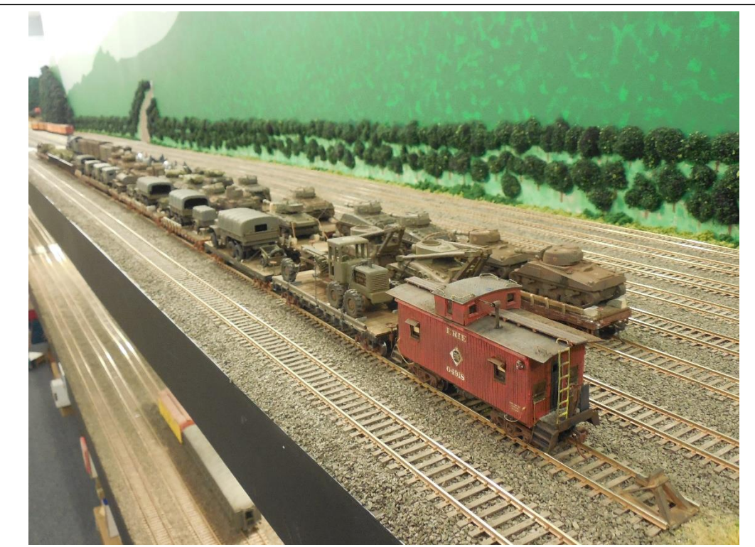
Pic 2: Viewed from the tail end