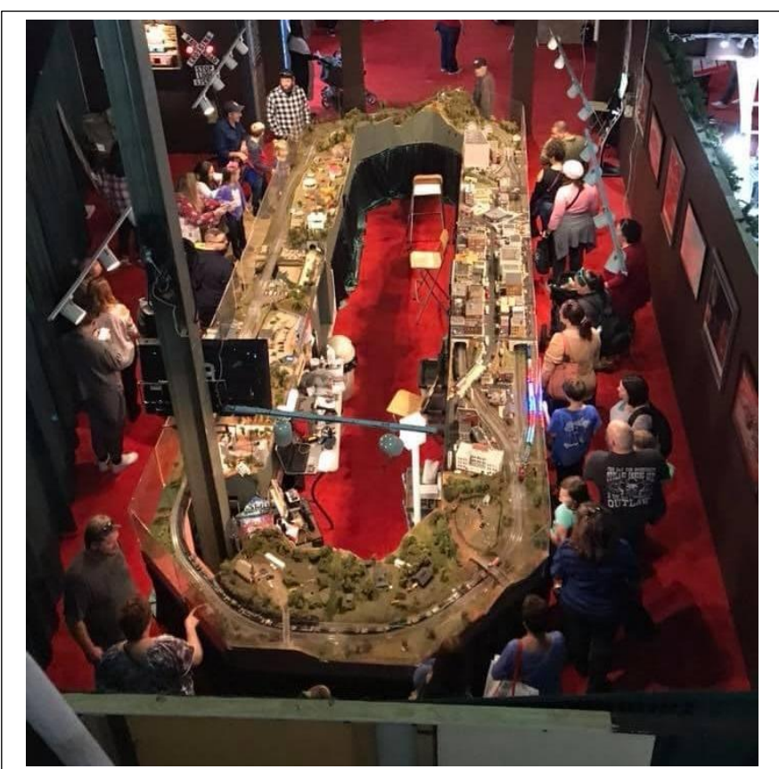
A typical Holiday display from a previous Metrolina Southern Christmas Show in Charlotte.