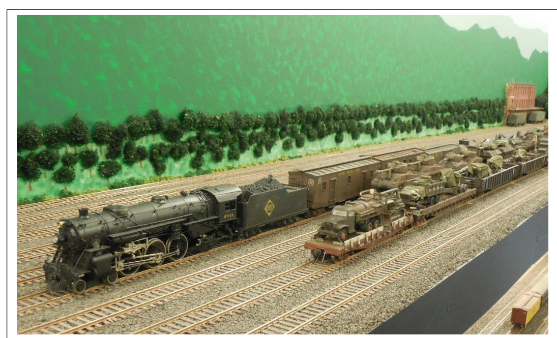
Pic 6: A USRA Heavy Pacific from Akane heads up the train in the staging yard.

To finish the train, I positioned an Erie USRA Heavy 4-6-2 Brass Steam Unit by Akane, at the head end in the staging yard (pic 6). Then I stretched the train out in my staging yard. From the overpass that separates West staging and the beginning of my layout, the train was 16 feet long, or almost 1400 feet in HO scale (pic 7). I believe helper service will be mandatory, because of weight on this train. So, this completes my side-tracked obsession with WW II military trains.