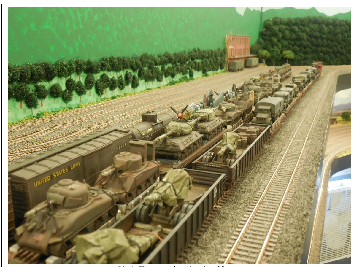
Pic 1: The completed train...29 cars

What started out as maybe 10-15 cars, grew to 29 pieces of rolling stock. There are 3 renovated boxcars, 1 tank car, 2 gondolas, and 22 flatcars, 6 are 52' and 16 are 40', followed by a Gloor-Craft Models Erie Caboose (pic 1, 2). To complete the consist, I built 2 flatcars with loads, 2 boxcars for military personnel, and the Craftsman kit Caboose (pic 3, 4, 5). The loads installed on the pieces of rolling stock consist of two P-51 aircraft, 19 tanks, 4 artillery pieces, 7 trucks, 1 Jeep, 1 bull dozer, 1 grader, and 3 ambulances. All were pivotal in the WW II European Theatre.