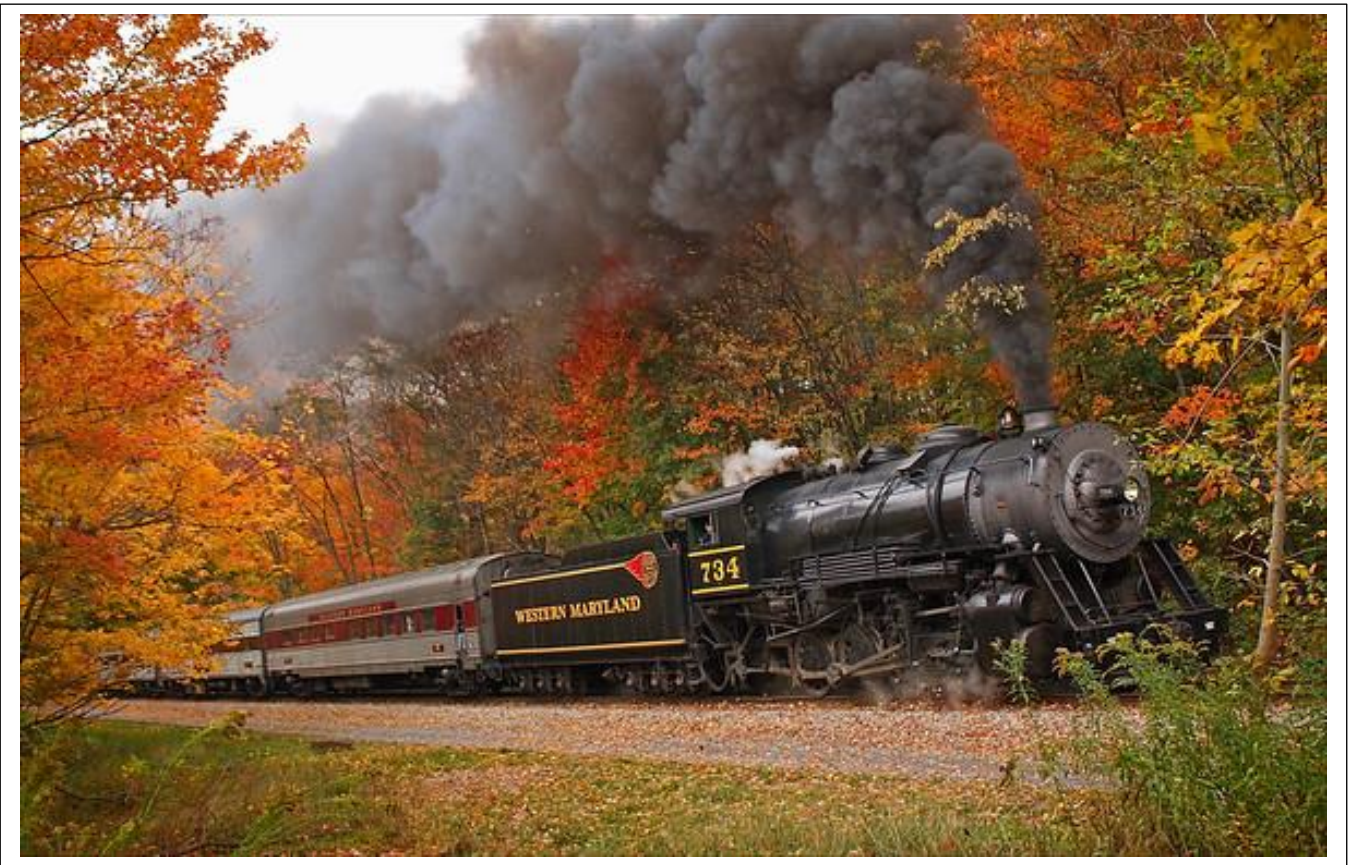
How's that for a Thanksgiving train?