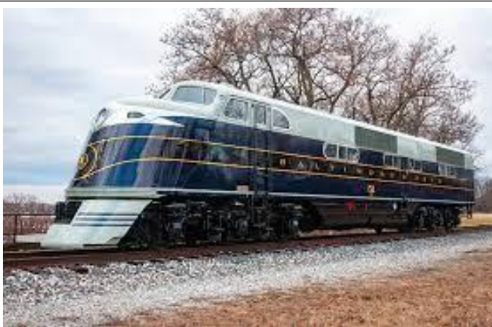
B&O #51 after cosmetic restoration by the B&O Railroad Museum in January of 2021

It was the first streamlined diesel not coupled to a dedicated trainset (like the Zephyrs or UP's M-10000). It was assigned to the flagship trains such as the Royal Blue, Capitol Limited, and National Limited.