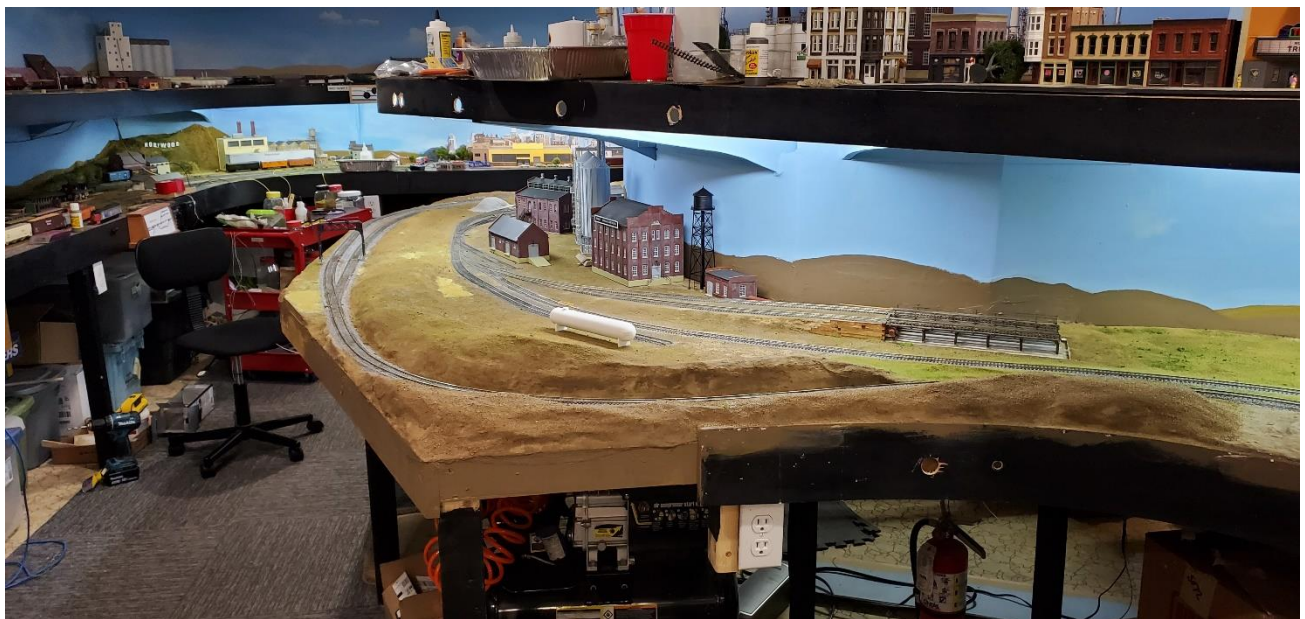
The backdrop is back in place hiding the helix, and Holly Sugar is at its new location in Betteravia. The new location is a more geographically accurate relationship on Joe's layout. Note the urban area on the upper level above. You'll see a drastic change on the next page.