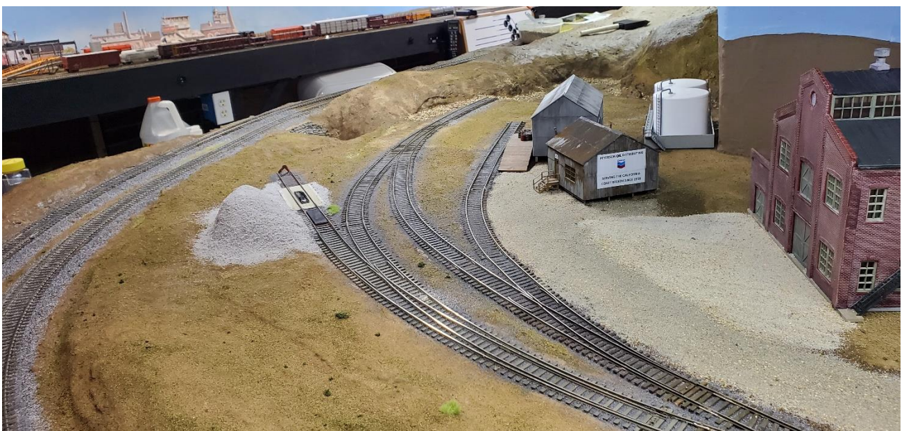
Looking around the corner from the previous photo, Peterson Oil Distributing awaits traffic. Note the short track at the end of the runaround – another switching challenge for operating sessions.