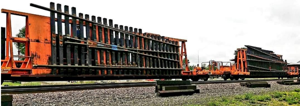
Prefabricated turnouts loaded onto specialized flat cars and ready for installation.