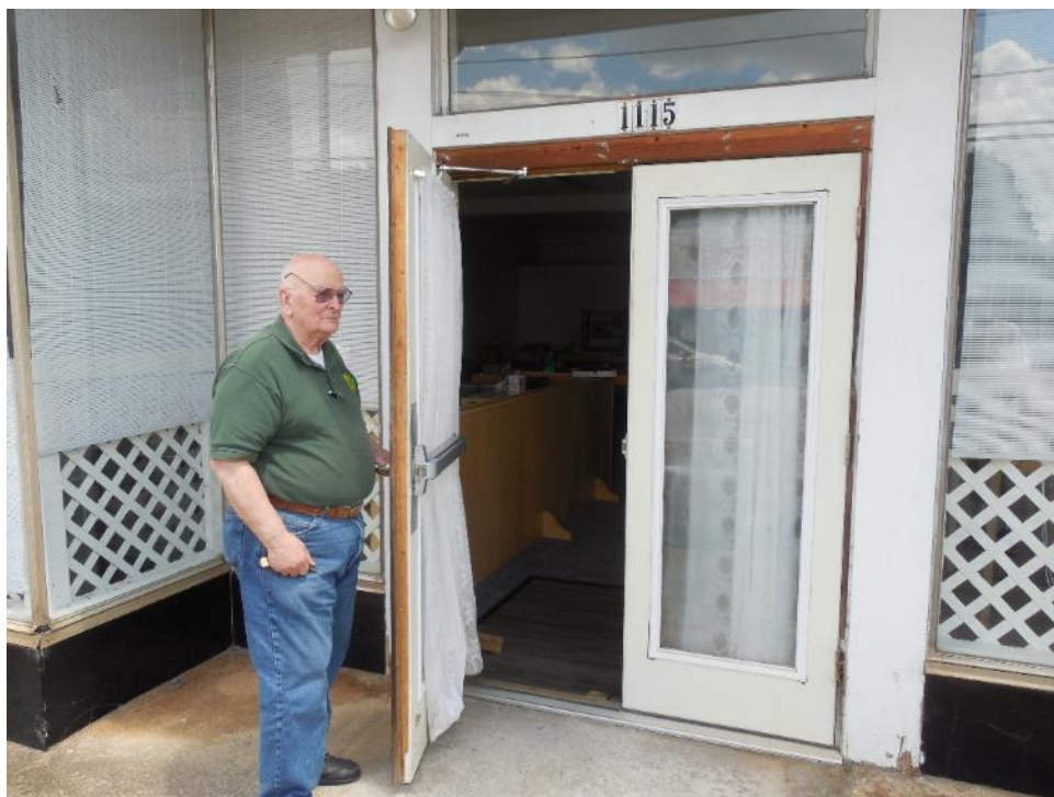
"Welcome to your new home!!"