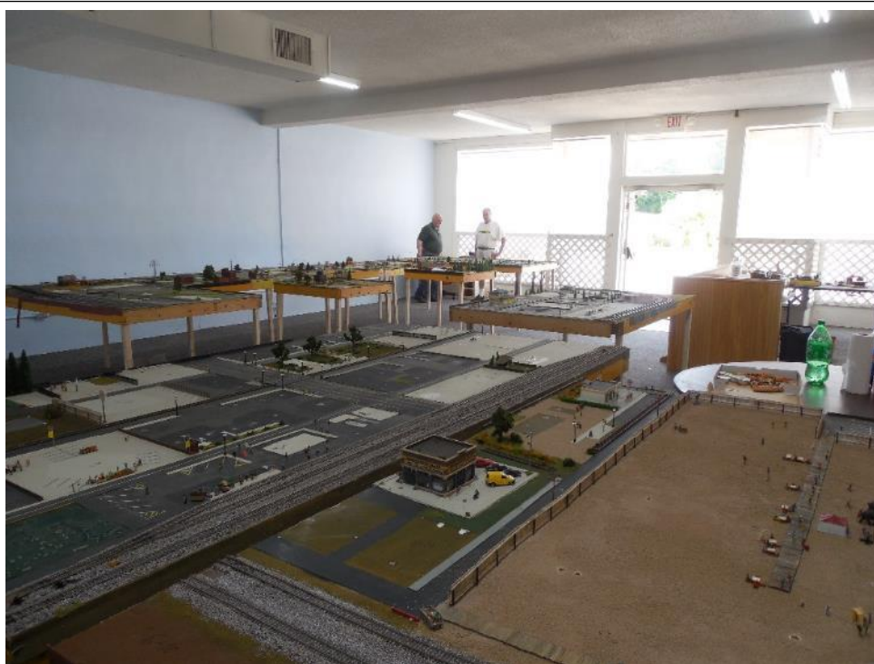
"Nice space, but we've got a ton of work left to do! Come and join in on the fun of putting Humpty Dumpty back together again..."