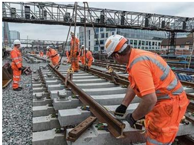
Workers preparing a section of track on concrete ties for lifting into place.