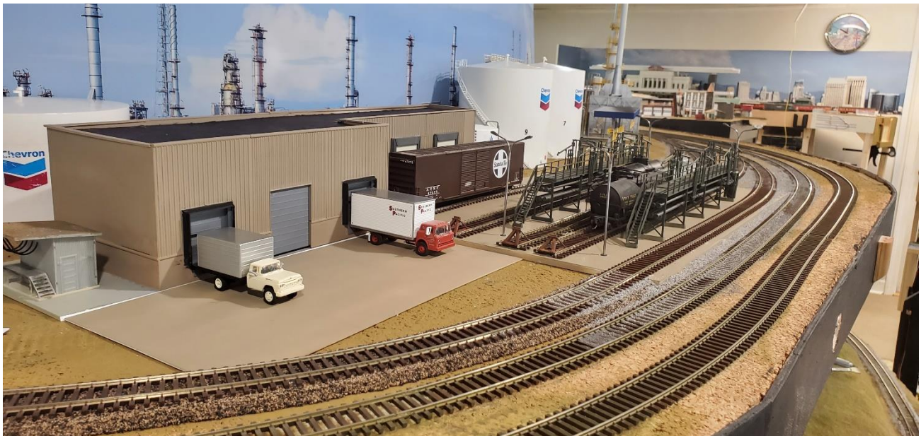
The upper level above Betteravia used to be the location of Joe Skorch's Union Station scene. It is now the location of a Chevron refinery. In the background to the right, you can see the structures from the previous scene awaiting transplanting to their future location on the layout.