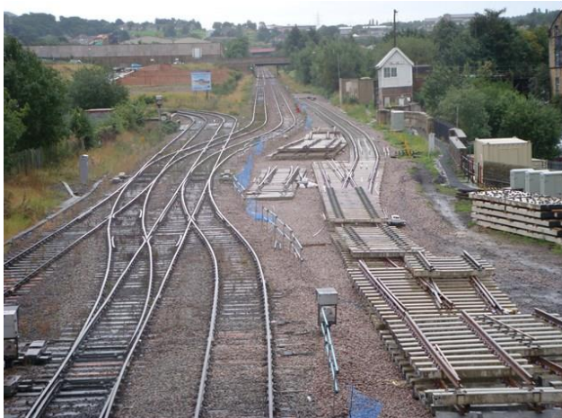
Prefabricated track sections along the right of way. Note the partially prefabricated turnout.