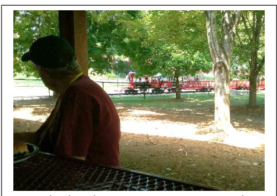
It can be hard to concentrate on speakers when there's a training running by.