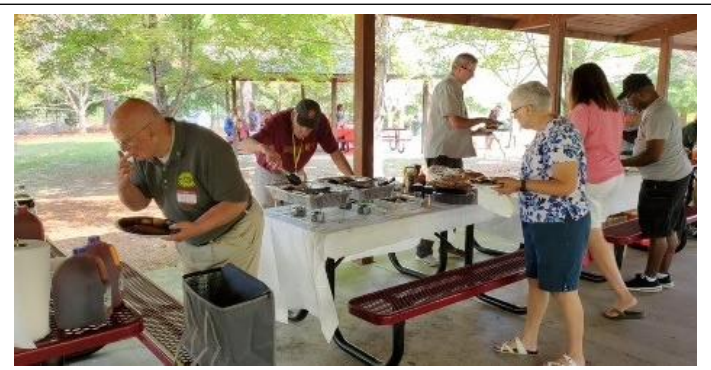
One way to get this group focused – FOOD, DRINK and FELLOWSHIP.