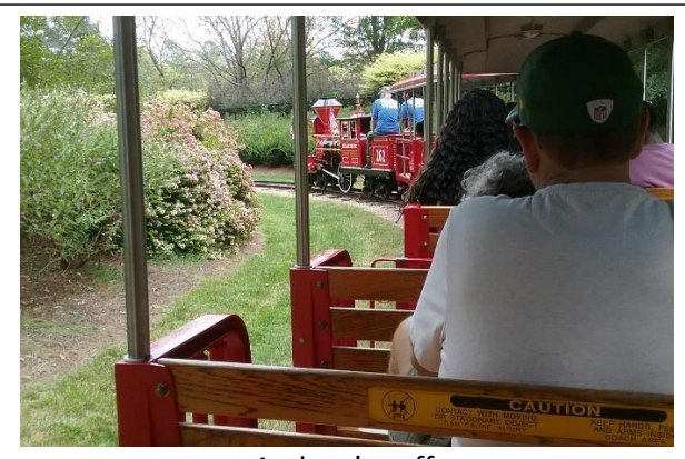
And we're off.