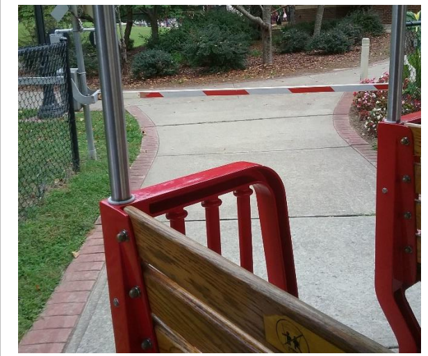
Crossing gates help protect park visitors as they stroll along the sidewalks.

Also at the park we walked around after the day's events to a double decker carousel from Italy. Horses, clam shells, and swings all gave motion as the music played and the carousel moved in a circle. I was surprised how the very small riders all wanted to go to the top, and parents and grandparents indulged them. I myself road the traditional horse, but no brass rings were available. The carousel is housed in an octagonal building and cared for by volunteers and park maintenance staff.