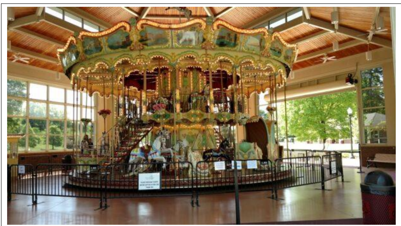
It was well worth my walk up the hill to see the double-decker Italian carousel. The ride was pretty fun too.

I hope you get a chance to visit, I think most week ends the train runs. Maybe we will have another Carolina Southern outing at the park.