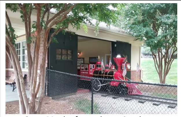
Crepe Myrtles frame the station doors.