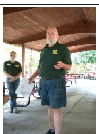
Neal's final Convention update