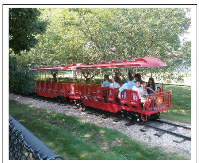
As the Division enjoyed a picnic, passengers waved on each pass.

The Kannapolis Rotary group built a building long enough and wide enough for 4 passenger cars and one steam engine to fit inside, cowcatcher to observation platform. Departure is from the building. Our ride had an engineer and apprentice engineer. It really was fun to see the smiling faces riding by and sometimes young people waving. Park trains are for the young at heart. A walking trail going up into Rowan County Park, passes through the cluster of shelters, and the miniature model train, brings a smile as visitors walk through the circle of track. It's bigger than G scale, and fun to ride, but still a model.