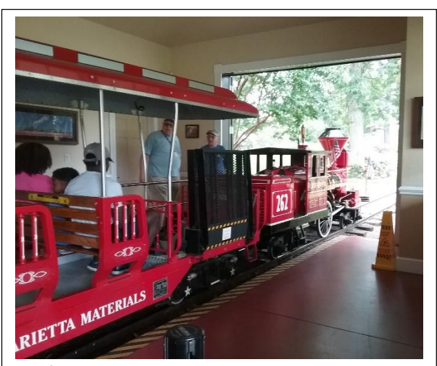
After the picnic, I decided to take a ride. The train leaves from its storage building.