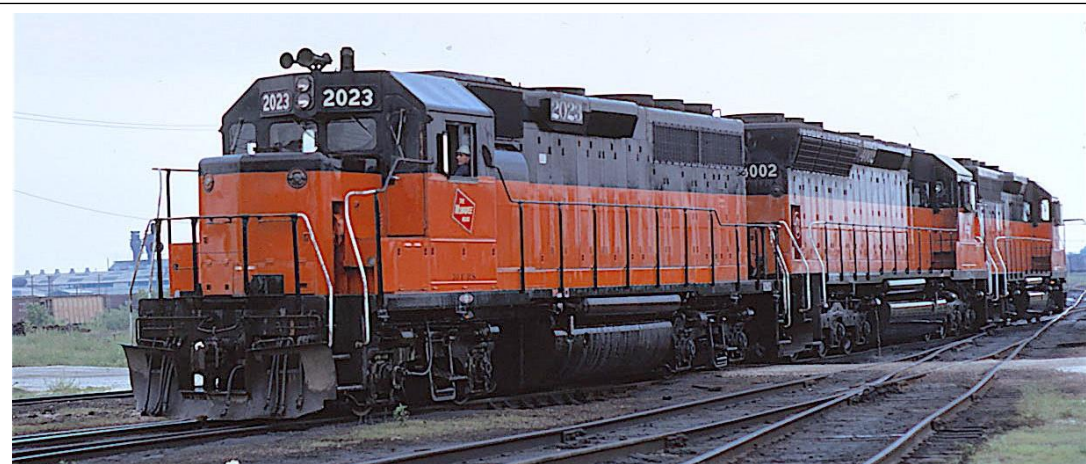
Milwaukee GP-40 #2023 leads a three-unit lash-up. All 3 look freshly shopped.