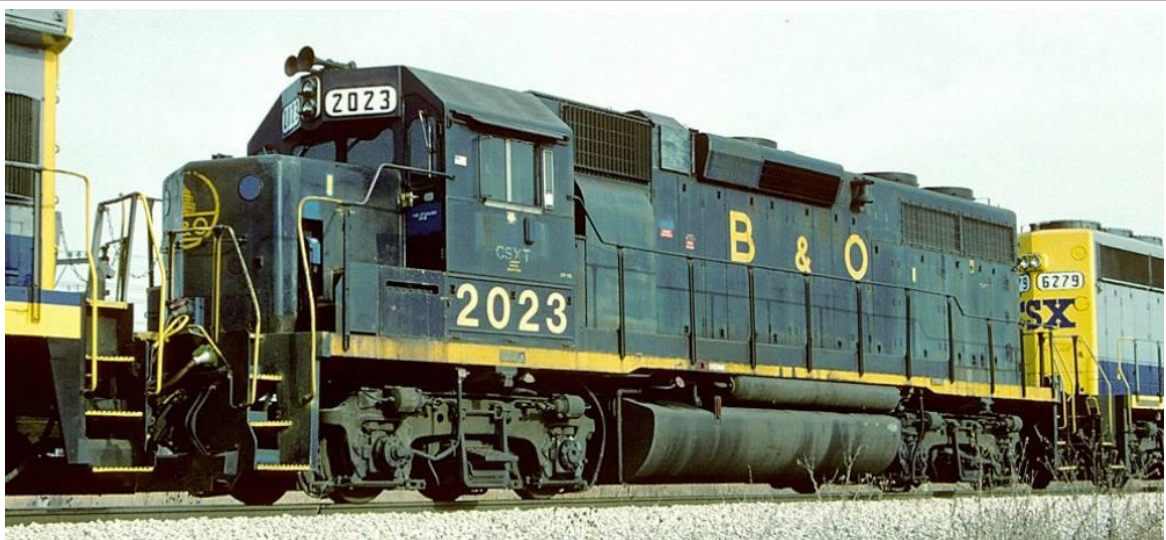
B&O GP-38 #2023. From the faint lettering under the cab window, this photo was taken after the CSX merger. It's surprising that the locomotive survived the Chessie era in its original livery.