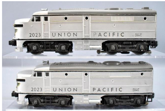
Back to model trains, Lionel offered Alco FA locomotives numbered #2023. For variety, they offered it in both silver and yellow. The silver scheme made for a good match on their passenger cars, but I was unable to find any confirmation of the prototype locomotives in any scheme other than the familiar Armour Yellow and Harbormist Gray.