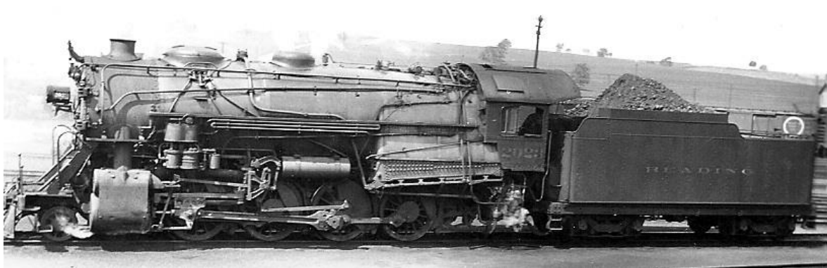
The Reading Railroad also had a #2023 in its steam roster, this one a Baldwin 2-8-0.