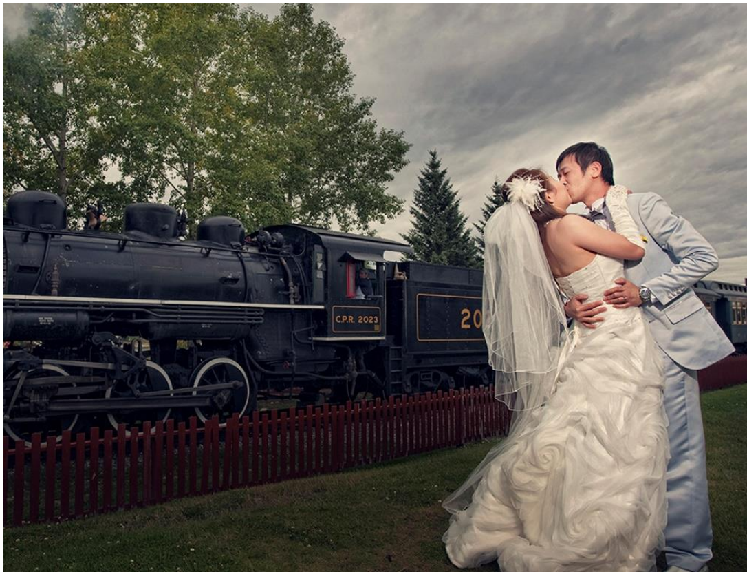
The best-preserved steam locomotive bearing #2023 is this 0-6-0 in CP Rail livery. The locomotive is at the Heritage Park in Calgary, Alberta, Canada. As seen on top, the locomotive occasionally pulls a few early passenger cars around the 217-acre park. As seen on the bottom, it also makes a nice background in one of the park's popular wedding venues.