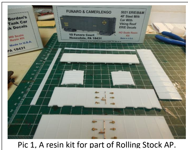
Pic 1, A resin kit for part of Rolling Stock AP.

I'm closing in on attaining the MMR award, needing one more AP merit award. I've decided to pursue the Rolling Stock AP. Needed for this category are 8 pieces of rolling stock; 4 scratch-built, and at least 1 passenger car. I'm in the process of laying out 4 resin kits, which I will detail, 1 being the passenger car, which in my case is a baggage car (pics 1 & 2). This will complete half of the assignment, allowing me to concentrate on scratch-building 4 pieces.