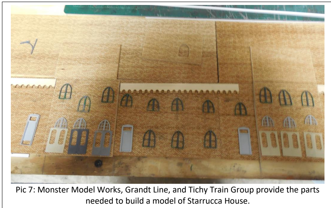
Pic 7: Monster Model Works, Grandt Line, and Tichy Train Group provide the parts needed to build a model of Starrucca House.

On top of all this, I'm preparing 2 clinics for our upcoming RMU. This is a great segue into reminding you that this event is a great day of clinics and model railroading. If you have never attended, you should mark your calendar for Saturday, April 15th, and plan on participating. The necessary links are in this Brass Pounder and on our website.