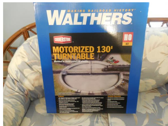
Pic 4: The updated version of the 130' turntable.

Finally, I'm in the process of scratch-building the Erie Station called the Starrucca House (pic 5). Using Erie architectural plans, pictures from books and magazines, and pictures I've taken, I have gathered a wealth of information for building this large building (pic 6). Also, Monster Model Works , a company that produces laser-cut wood siding, is back in business, so I purchased enough sides along with parts from Grandt Lines and Tichy to build the project (pic 7). I had to purchase woodworking tools for making intricate cuts, but these made great Christmas presents. Plus, you can never have enough tools.