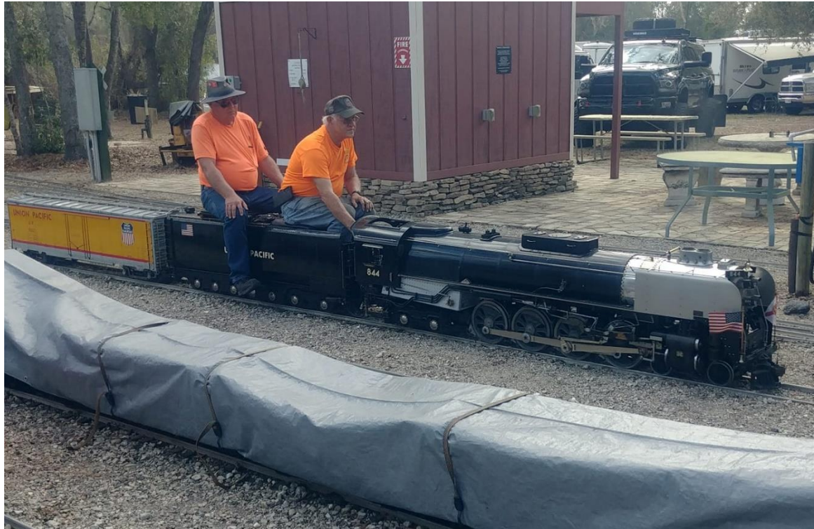
Some live steam action on the CP&G.