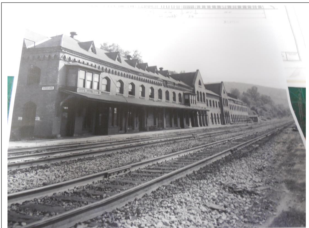
Pic 5: A vintage photo of Starrucca House.

Finally, I'm in the process of scratch-building the Erie Station called the Starrucca House (pic 5). Using Erie architectural plans, pictures from books and magazines, and pictures I've taken, I have gathered a wealth of information for building this large building (pic 6). Also, Monster Model Works , a company that produces laser-cut wood siding, is back in business, so I purchased enough sides along with parts from Grandt Lines and Tichy to build the project (pic 7). I had to purchase woodworking tools for making intricate cuts, but these made great Christmas presents. Plus, you can never have enough tools.