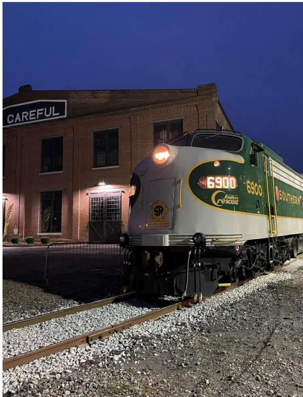
6900 ready to pull the Wine & Dine train.