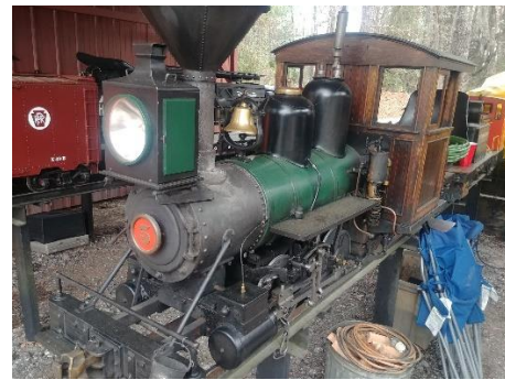
Firing up the steamers.