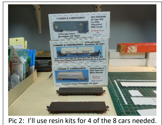
Pic 2: I'll use resin kits for 4 of the 8 cars needed.

Also, I've decided to upgrade my Walthers 130' turntable (pic 3). I purchased an early edition turntable about 7 years ago and by the time I got around to installing it, the system had been vastly improved. So, I purchased a new 130' (pic 4) and the advanced module upgrade. With the help of my electronics guru, Fred Miller, MMR, we are working on controls for a 24-track turntable system. If anyone is interested in an older version of the Walthers Cornerstone, 130' DCC Turntable, used only once to program the tracks, please contact me.