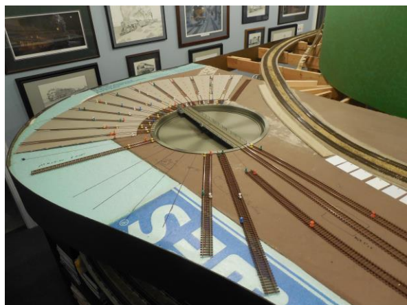
Pic 3: Tracks for 130' turntable laid out.