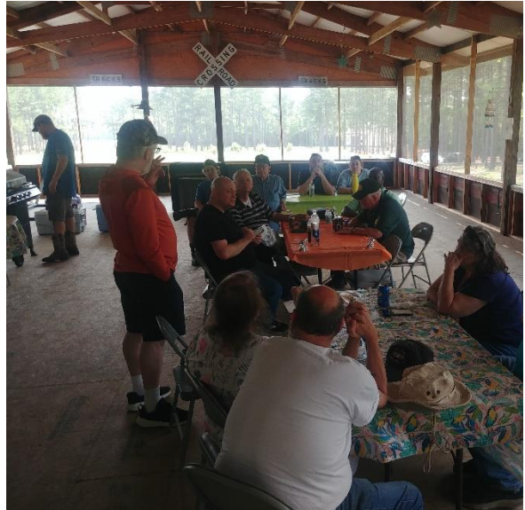
Additional group discussion.