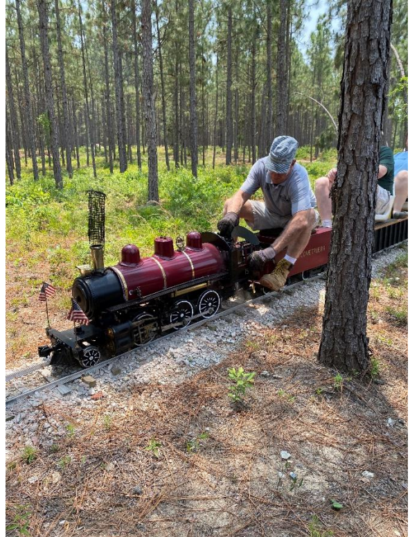
And the ride through the pine trees begins. Riding behind a live steam model is a lot of fun – try it sometime.