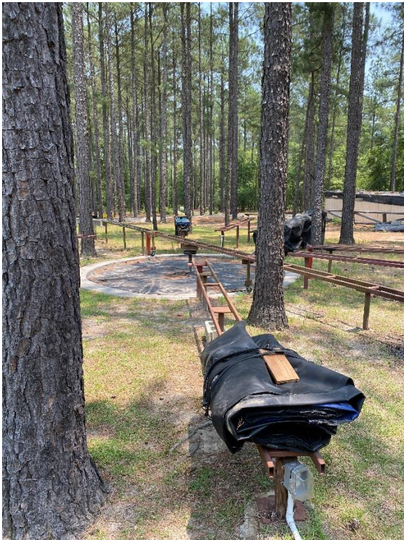
The turntable provides a means to transfer equipment from trucks and trailers onto the railroad.