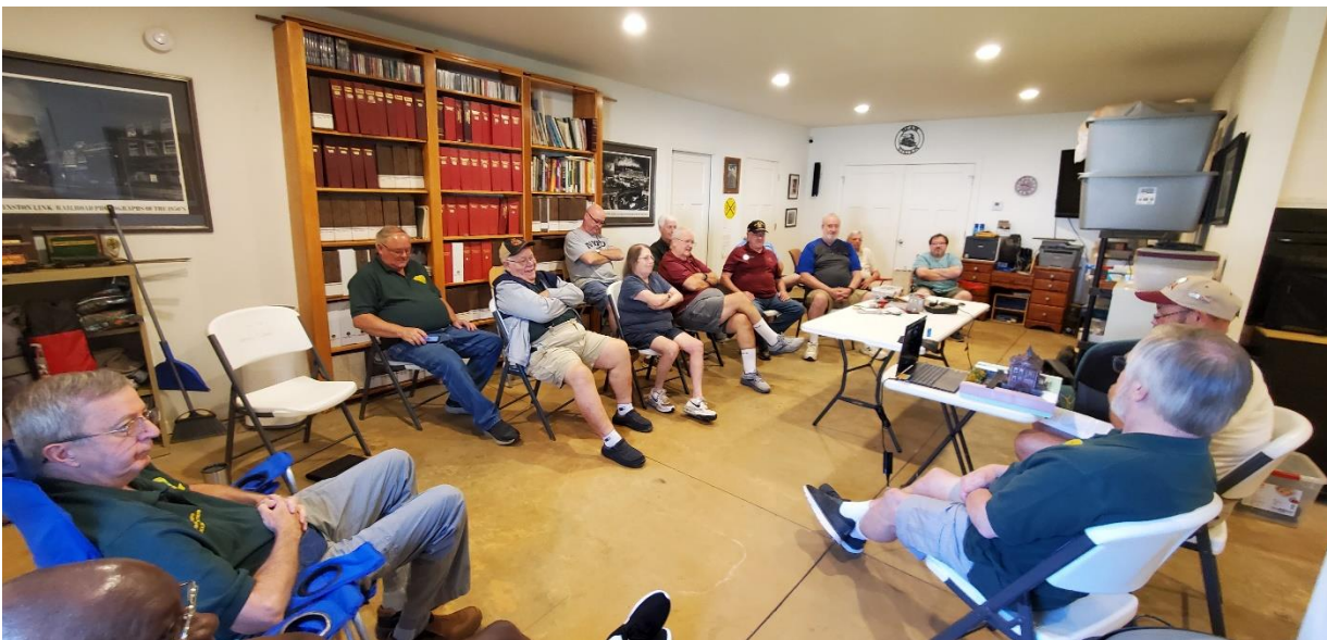
A good turnout to a great venue. How about that well-organized model railroad library in the background!