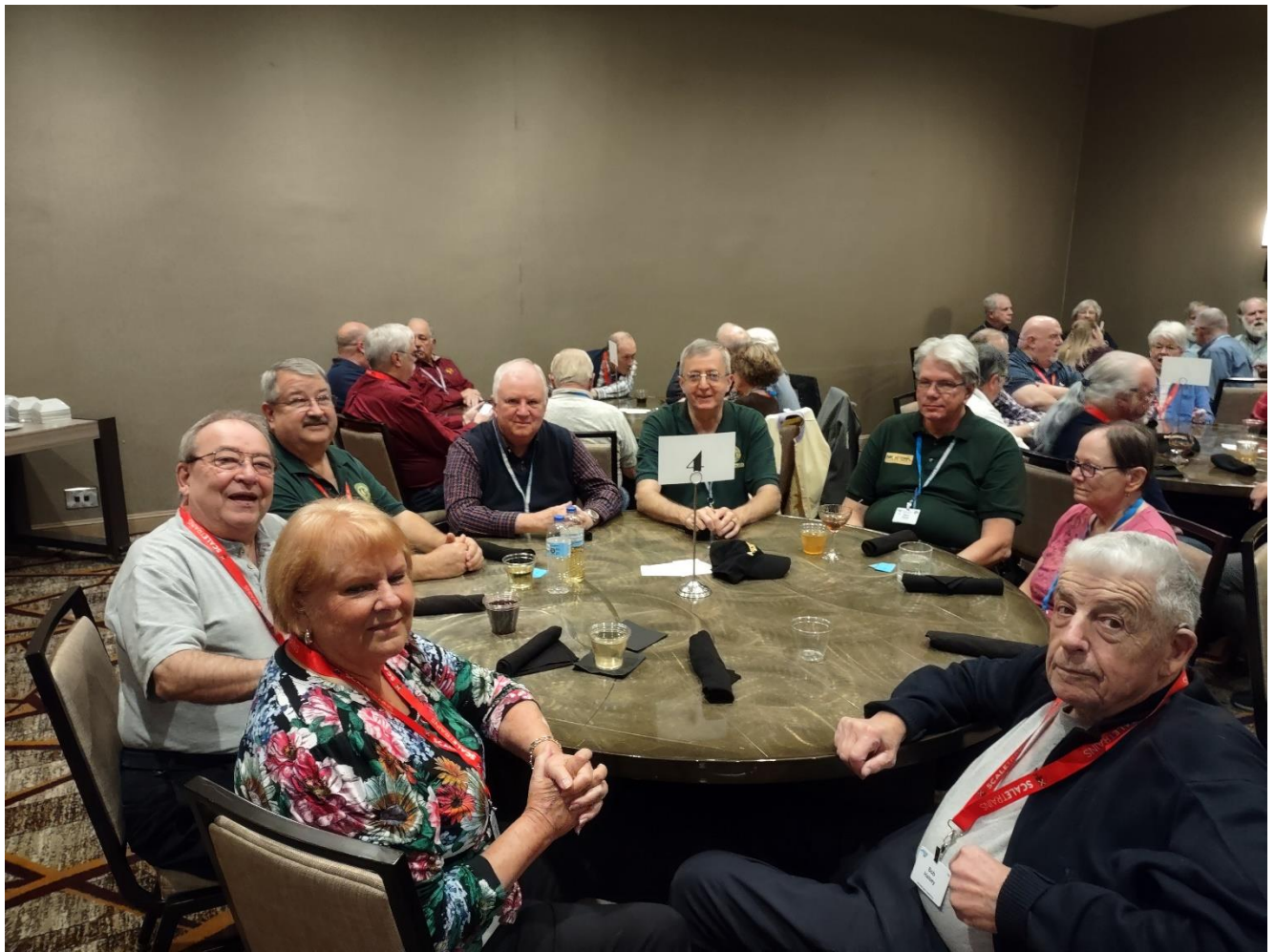
The gang's partially here! Here's just a few of the CSD folks getting ready for the BBQ spread that awaits them.