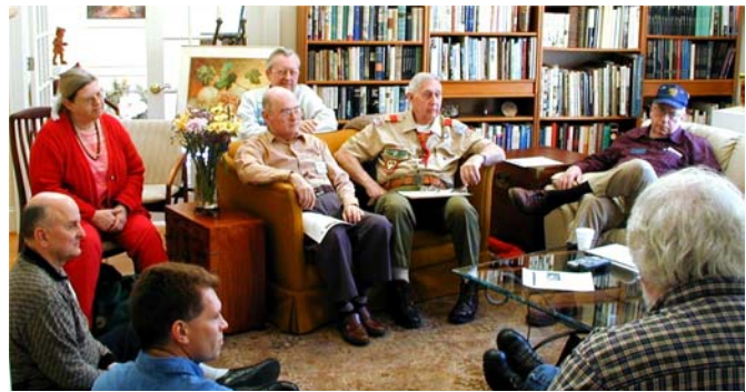
Division Members listen attentively